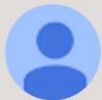
A Google user

Works pretty well so far. I like that you can type several things and then it will list them.